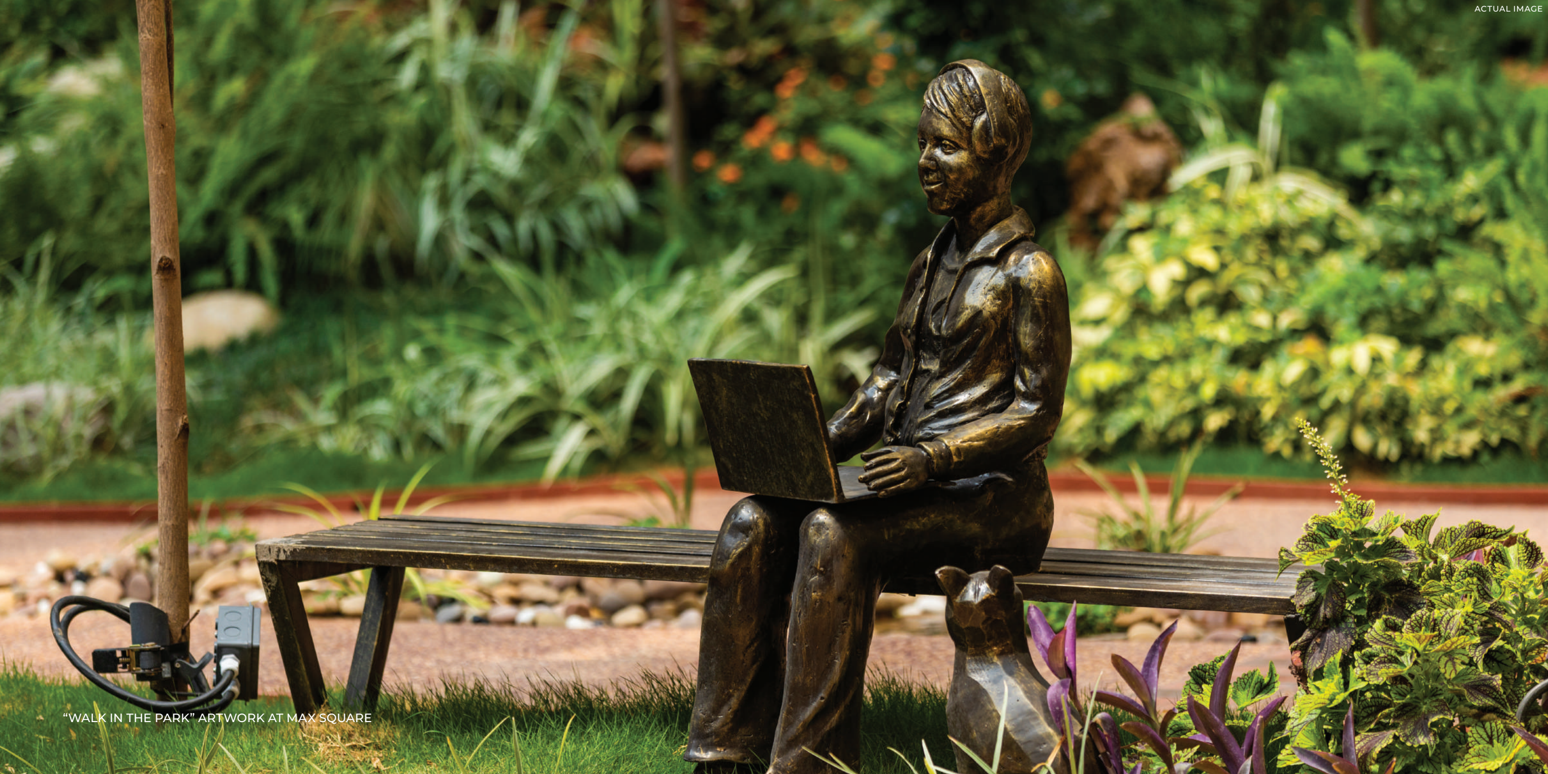
"WALK IN THE PARK" ARTWORK AT MAX SQUARE