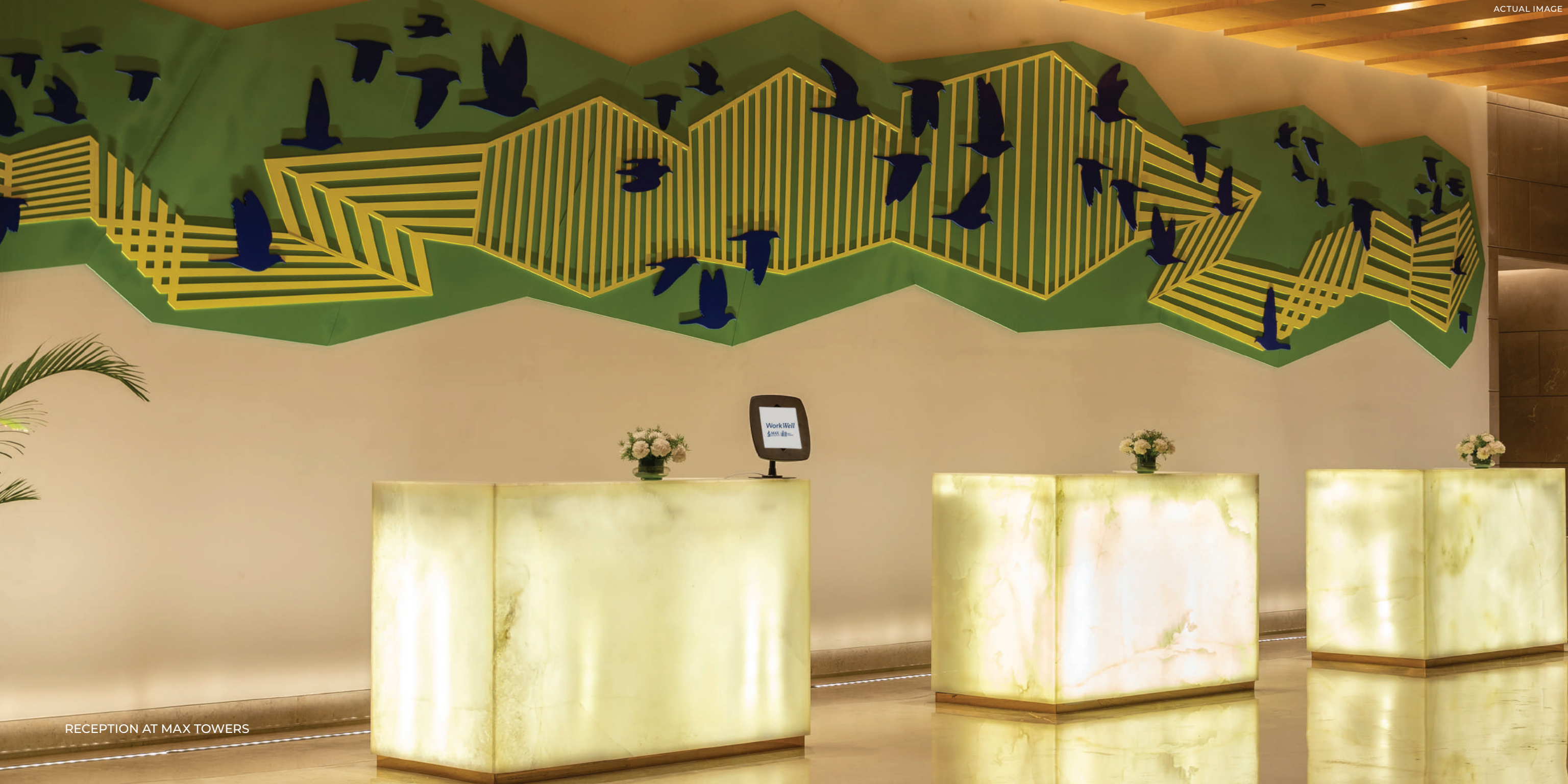
RECEPTION AT MAX TOWERS