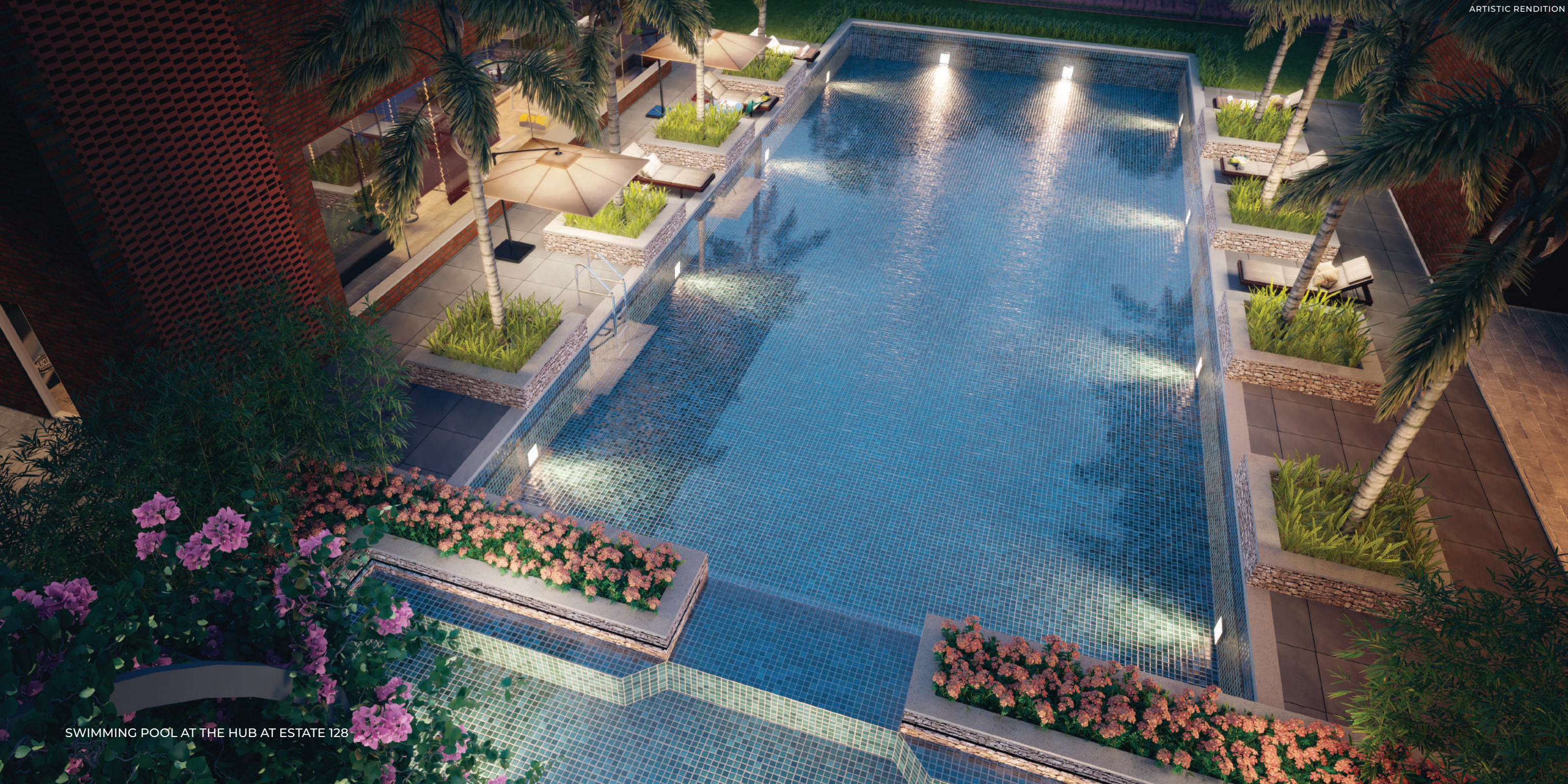
SWIMMING POOL AT THE HUB AT ESTATE 128