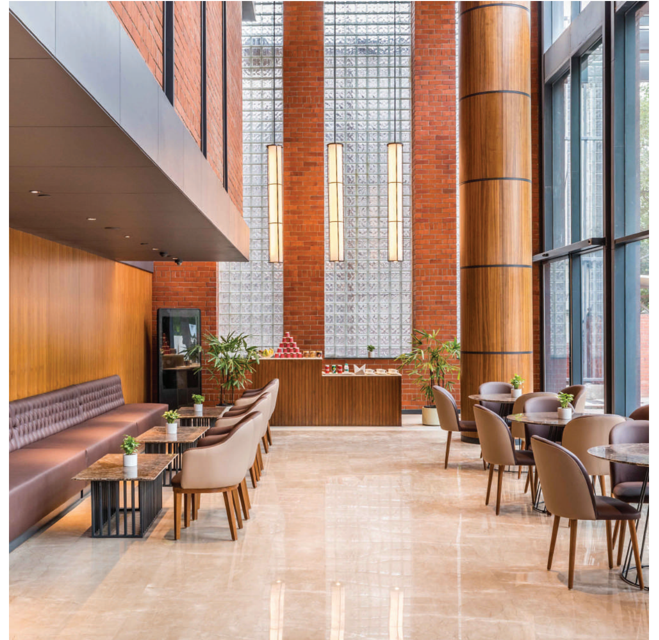
RECEPTION LOBBY AT MAX HOUSE