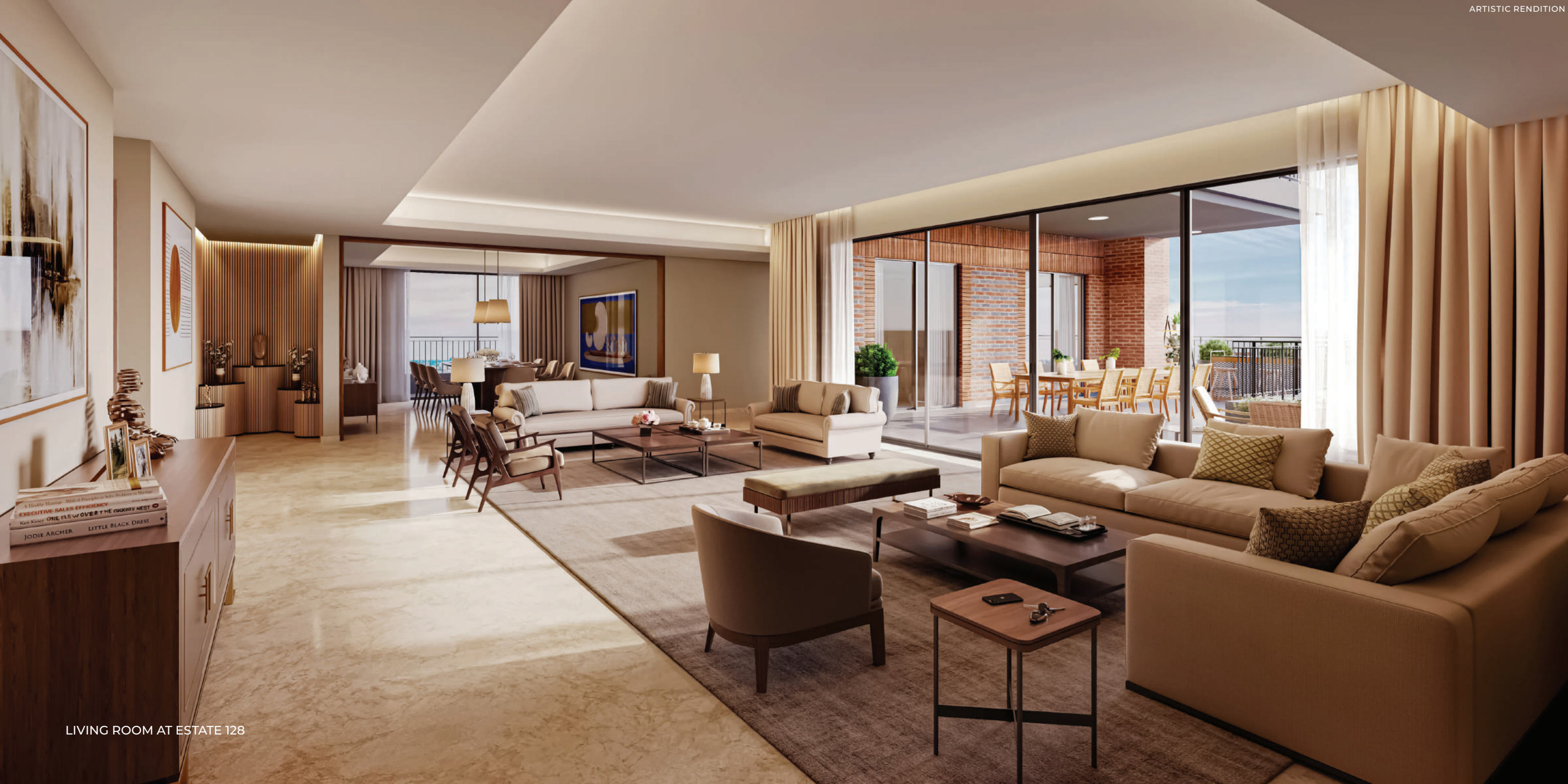
LIVING ROOM AT ESTATE 128