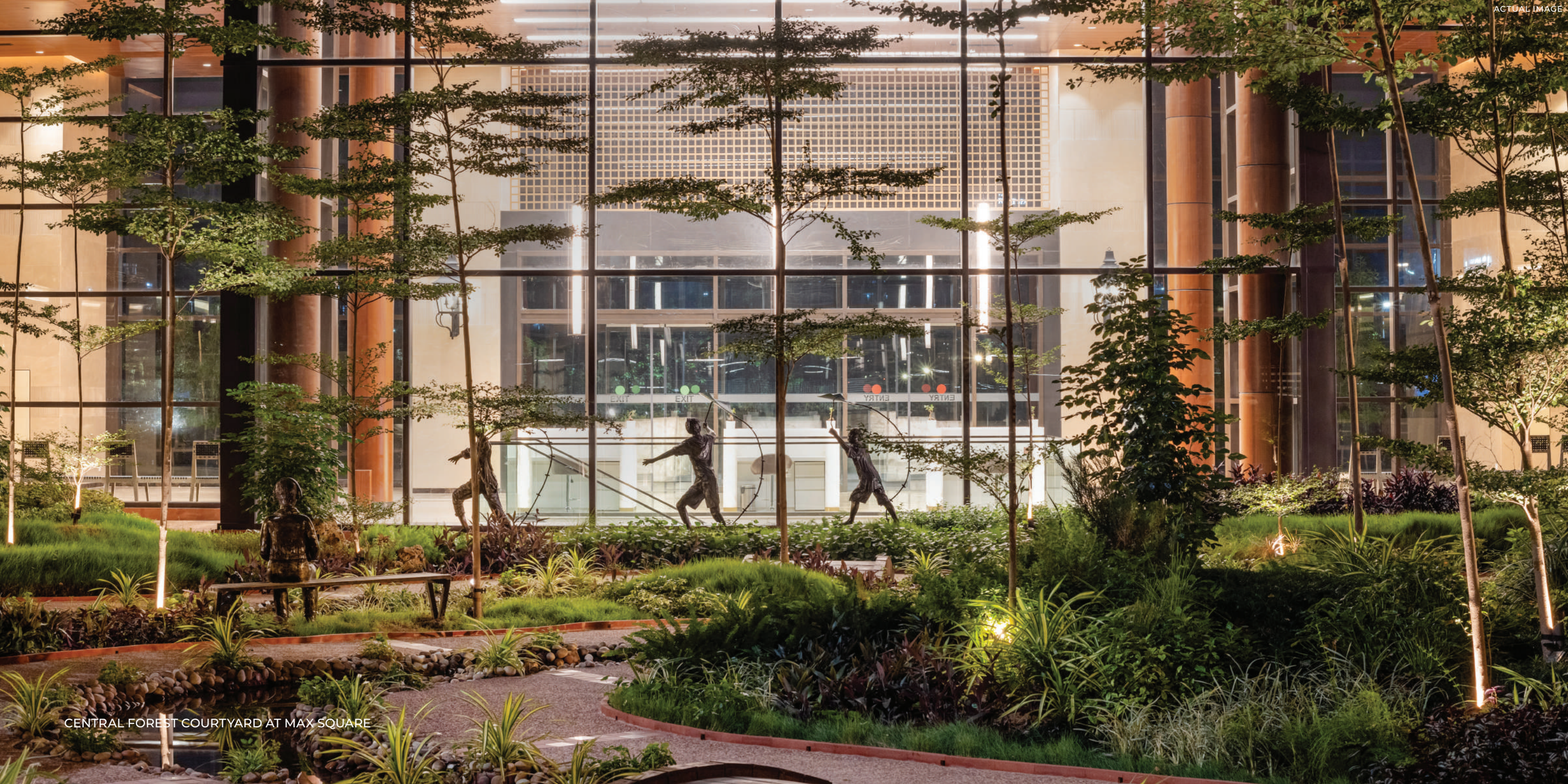
CENTRAL FOREST COURTYARD AT MAX SQUARE