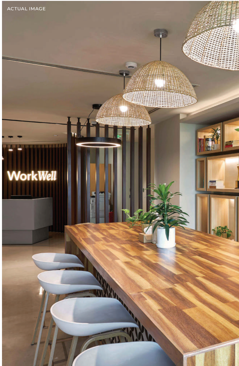
WorkWell SUITES AT MAX HOUSE