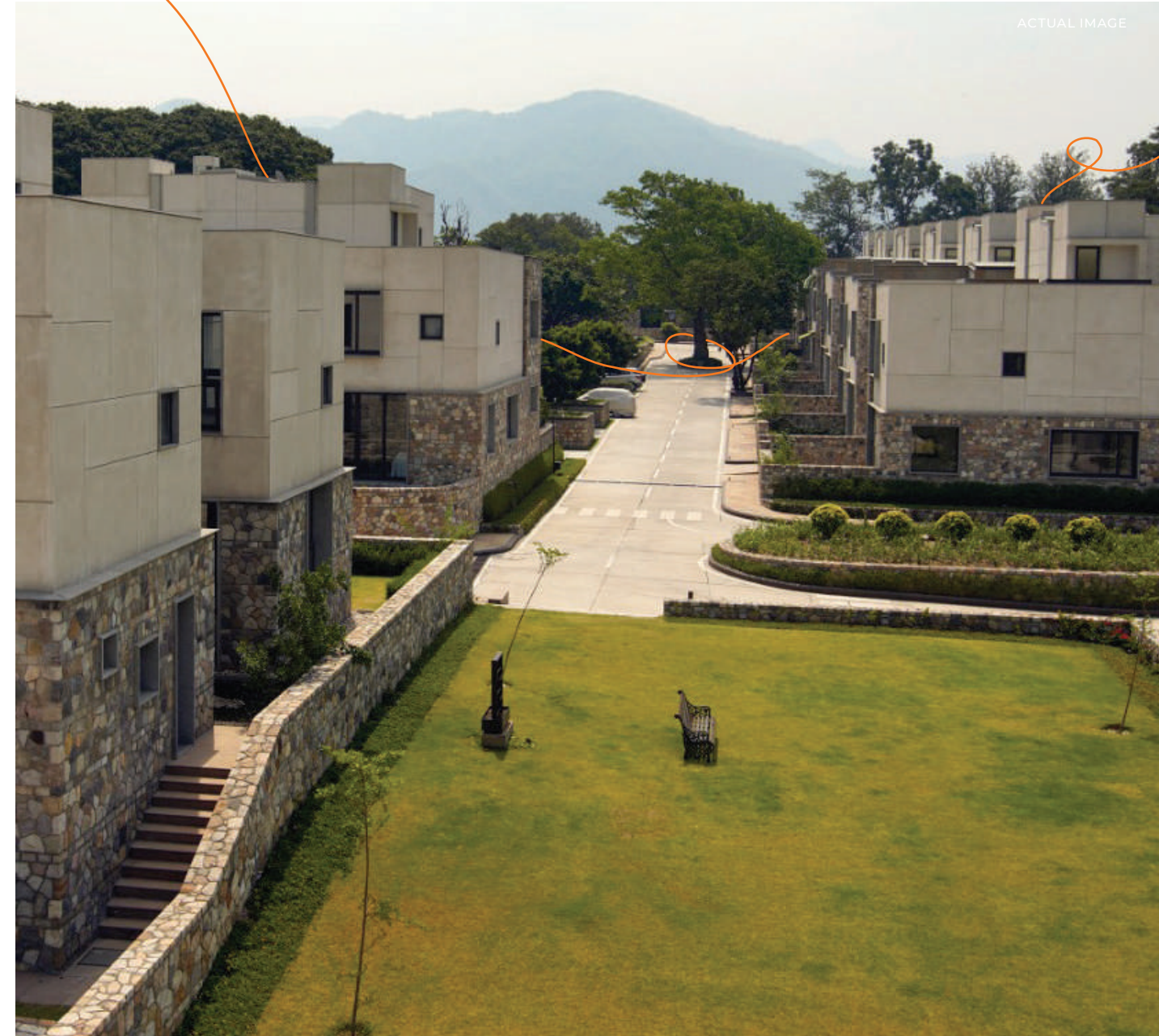
222 RAJPUR, DEHRADUN

222 Rajpur is a premier residential community located adjacent to the Malsi forest, at the most exclusive address in Dehradun. Spread across 5 acres, 222 Rajpur offers a limited inventory of 22 villas to those discerning homeowners who value privacy and desire a life of tranquility in the lap of nature.