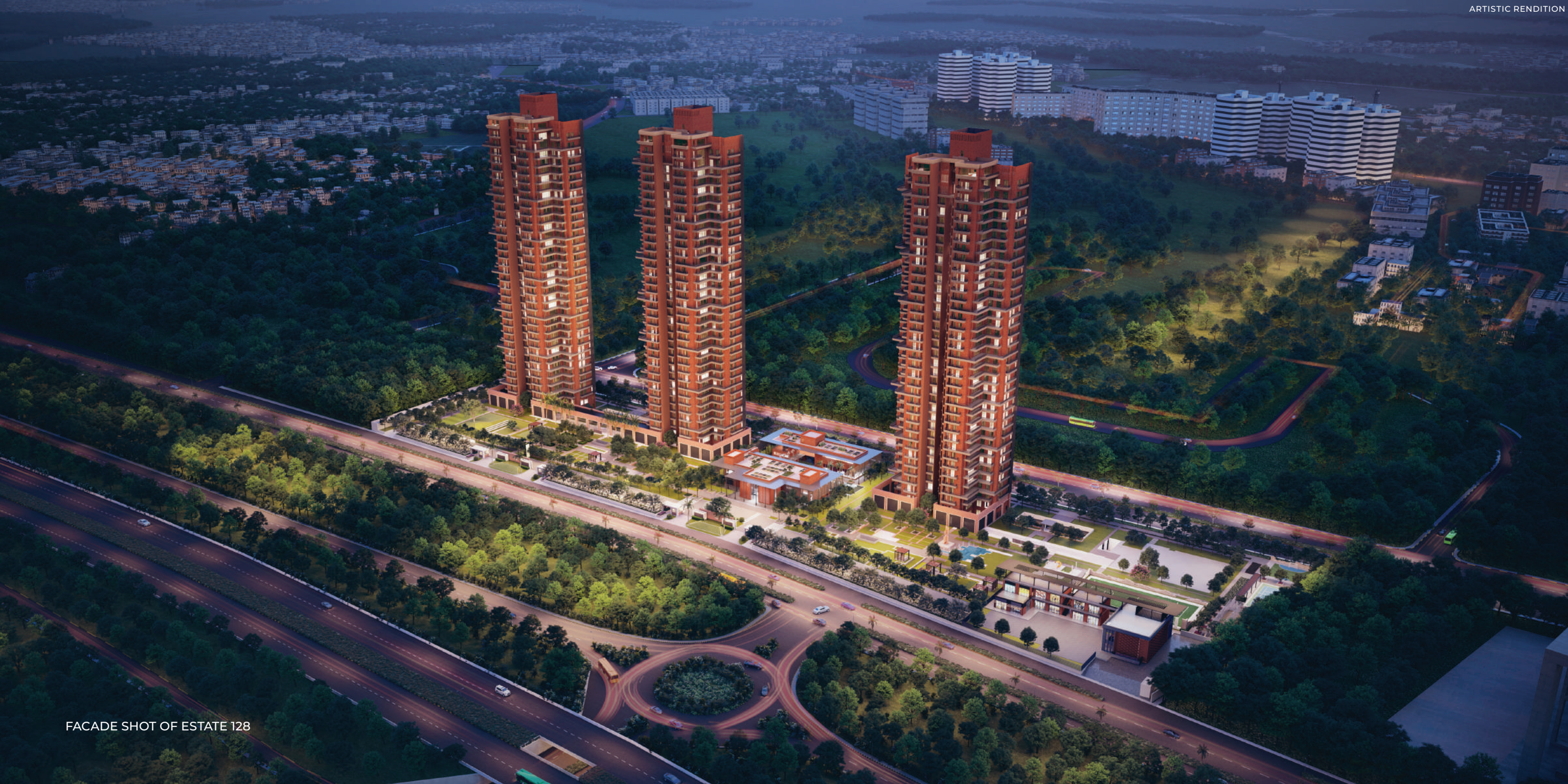
FACADE SHOT OF ESTATE 128