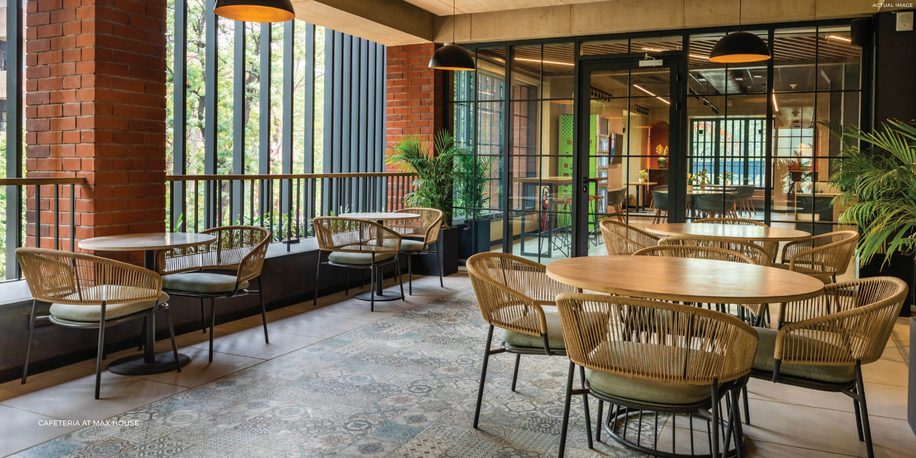
CAFETERIA AT MAX HOUSE