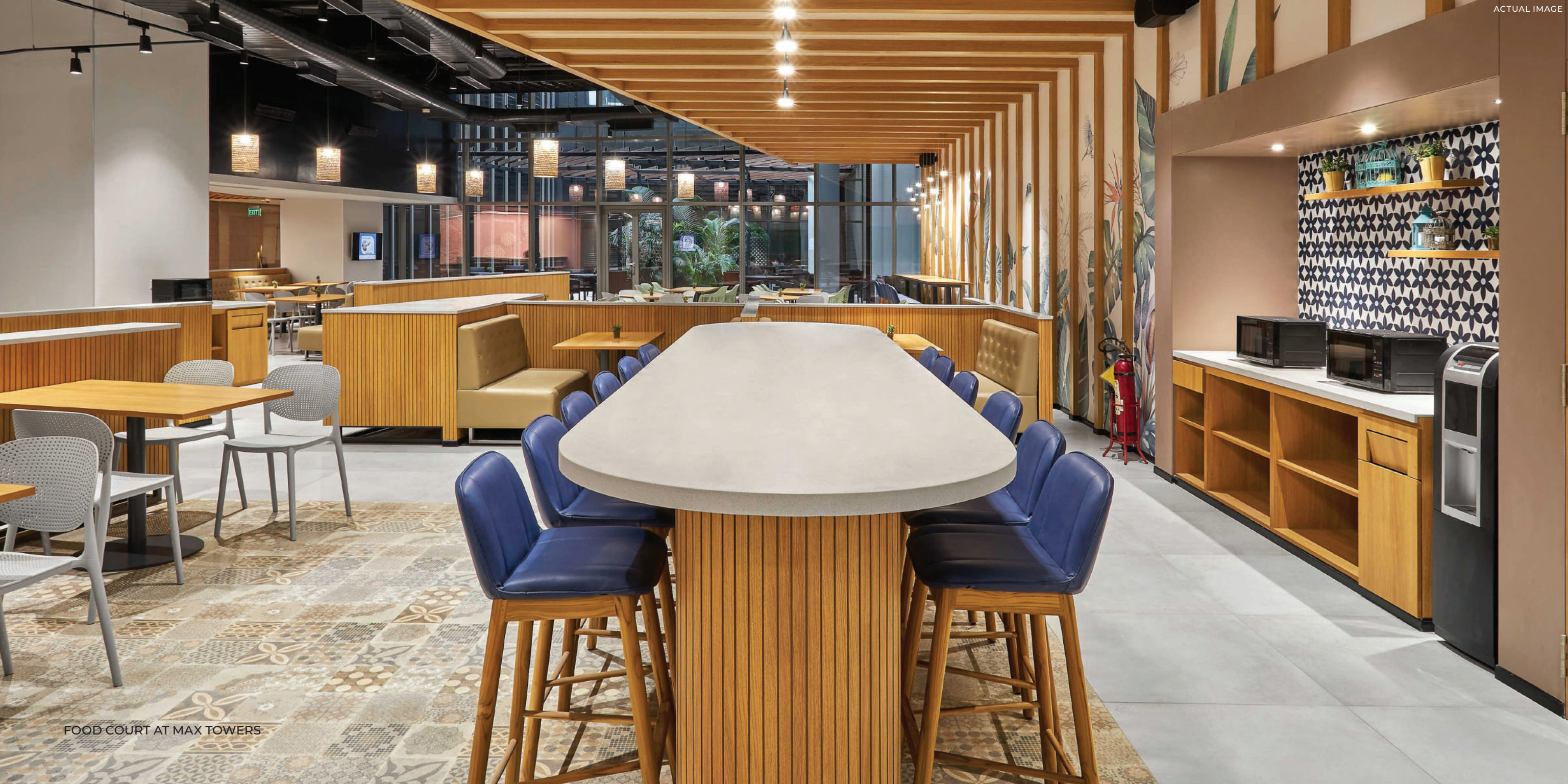
FOOD COURT AT MAX TOWERS