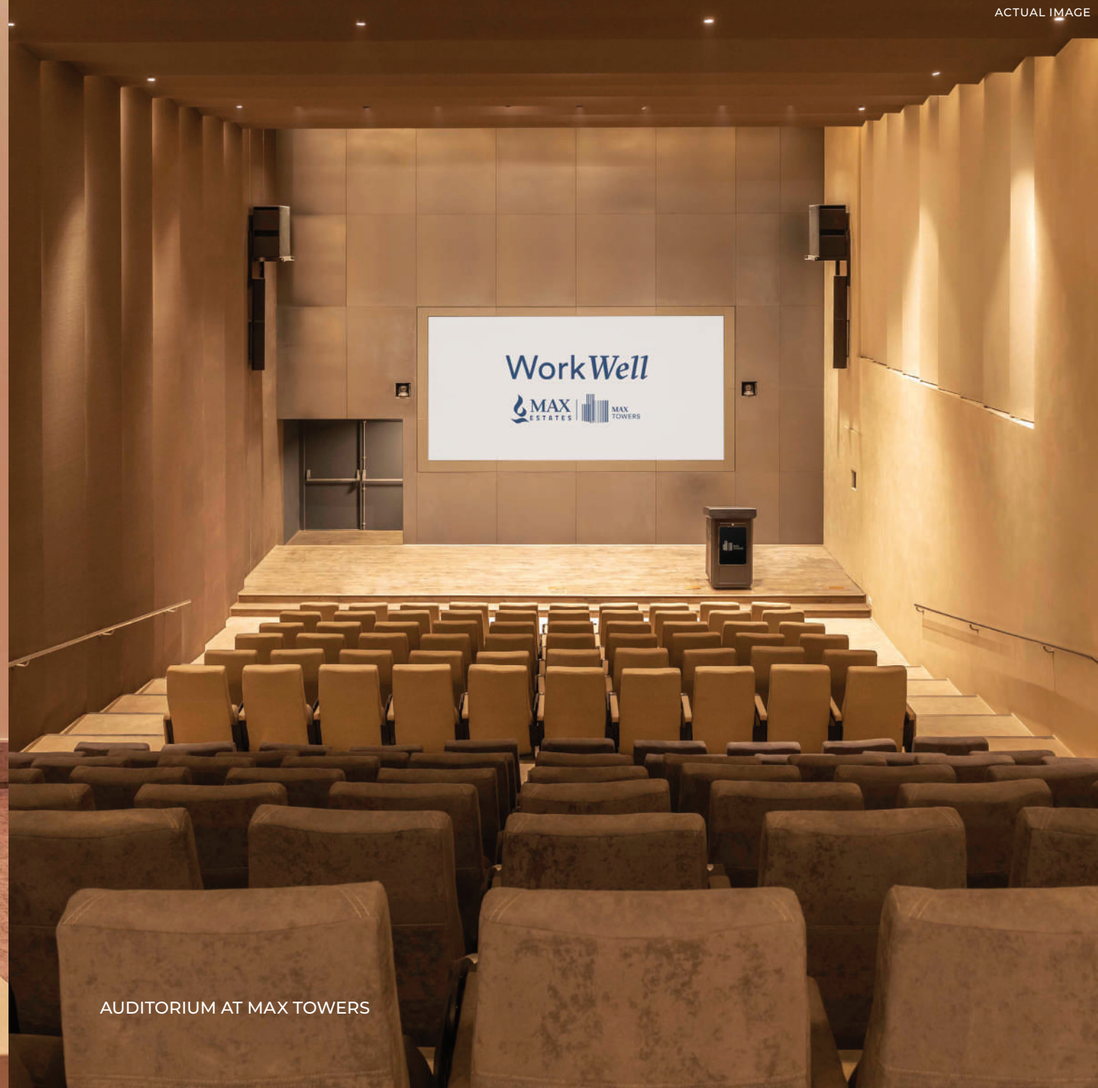
AUDITORIUM AT MAX TOWERS