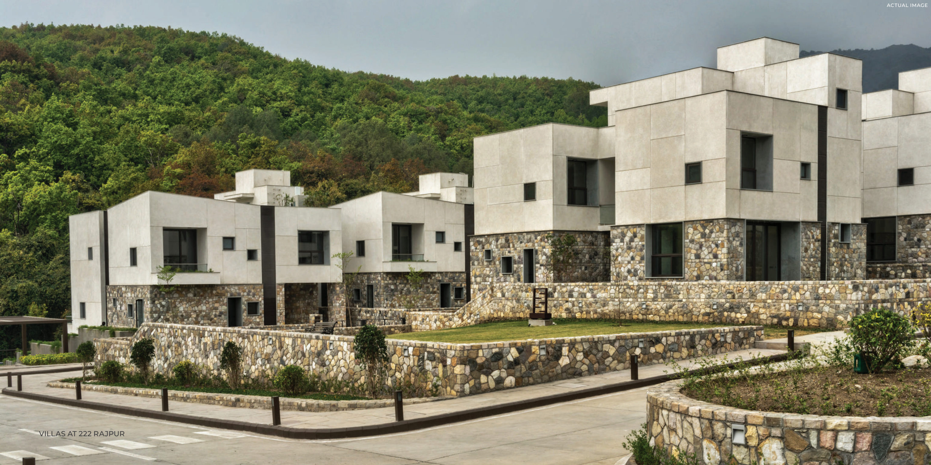
VILLAS AT 222 RAJPUR