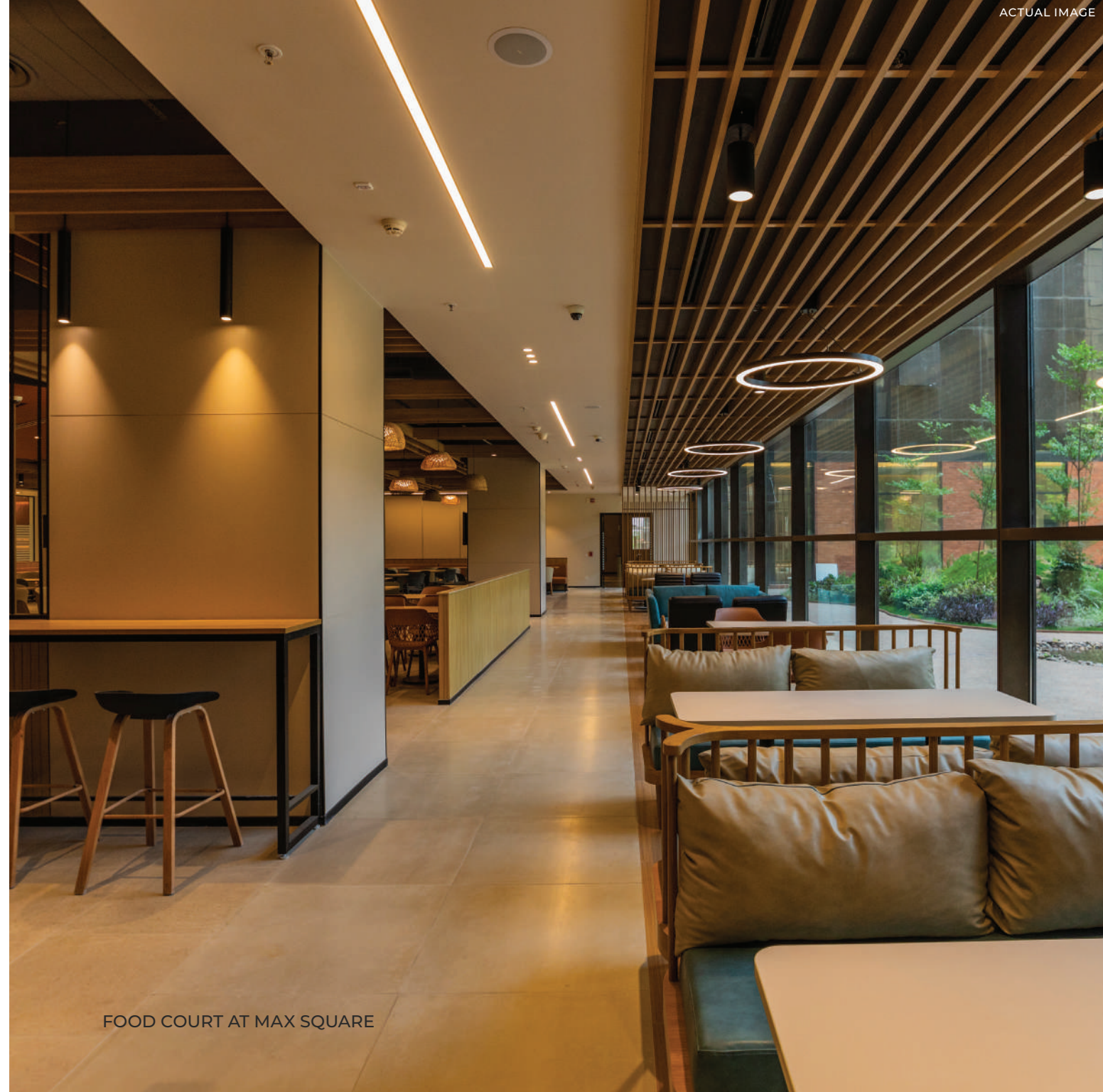
FOOD COURT AT MAX SQUARE