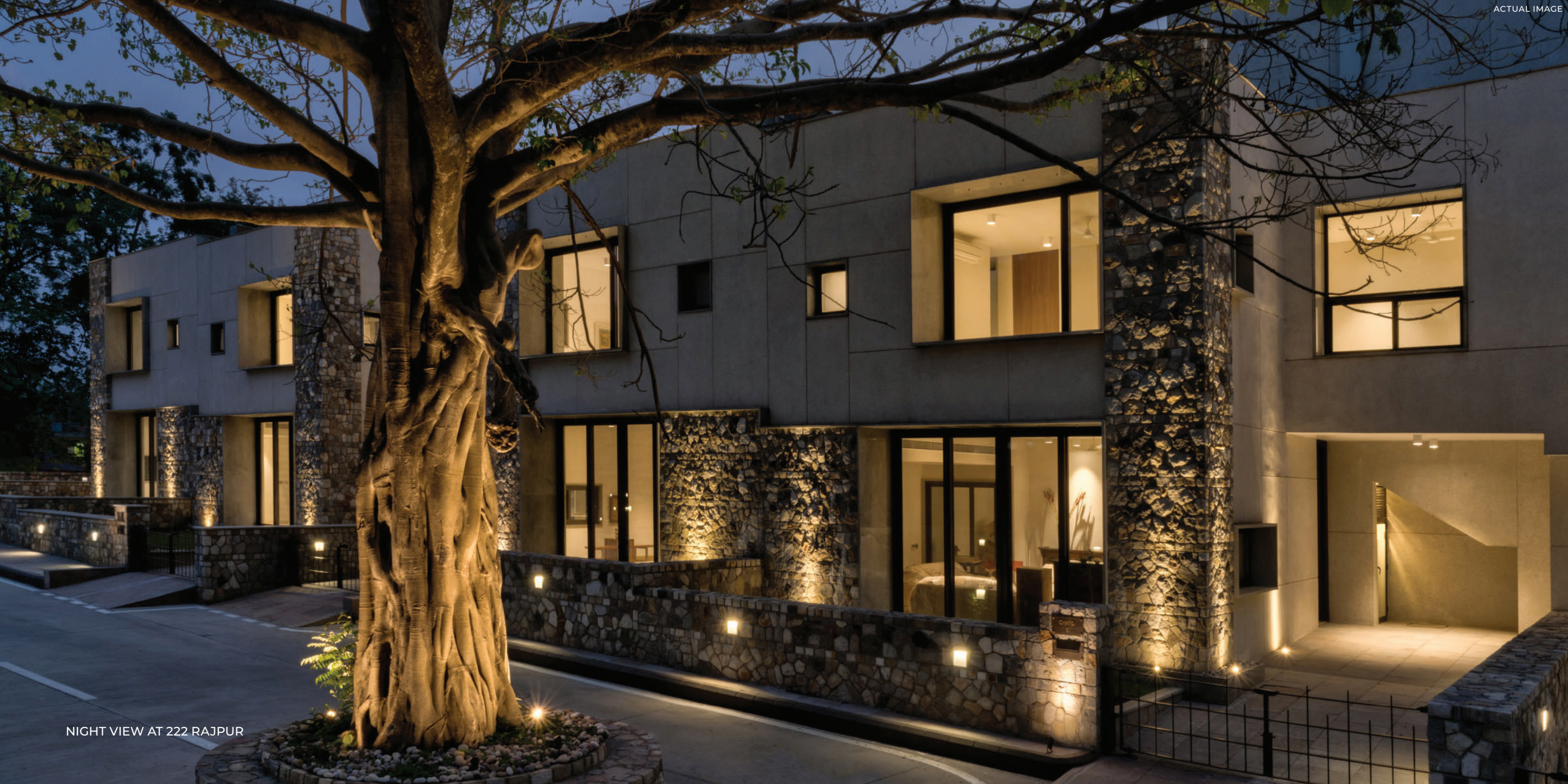
NIGHT VIEW AT 222 RAJPUR