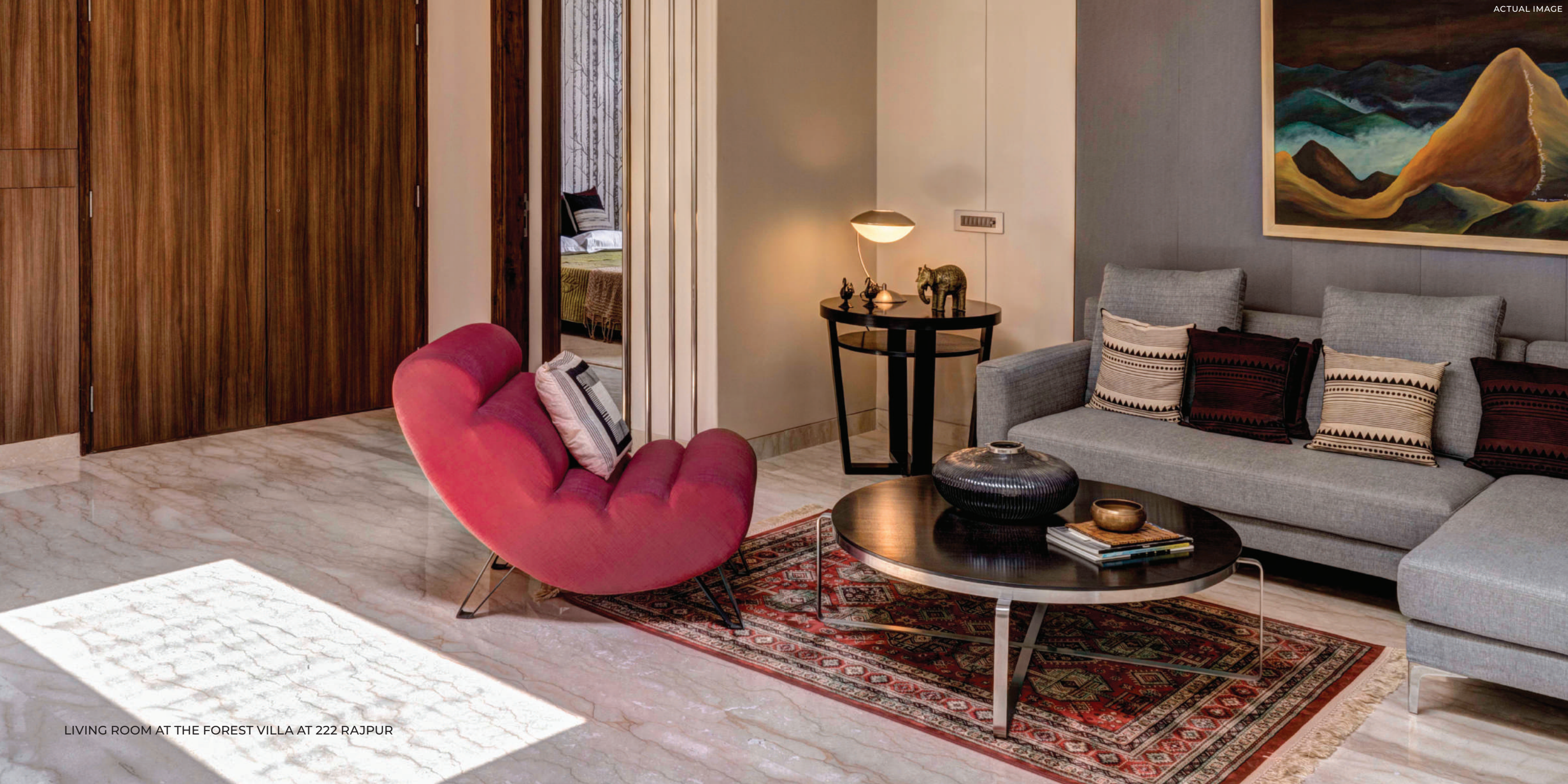
LIVING ROOM AT THE FOREST VILLA AT 222 RAJPUR