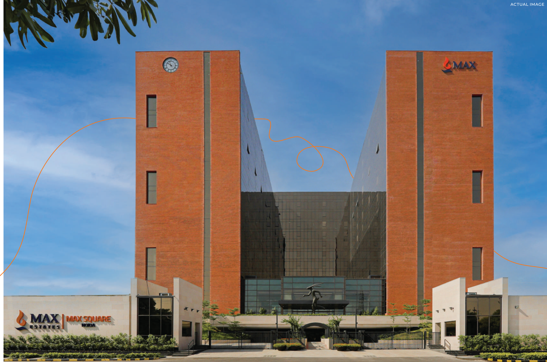
MAX SQUARE, NOIDA

Built on the theme of nature and nurture, Max Square is a unique office space, with a ~11000 sq. ft. forest in its midst. It pays attention to the crucial elements that make up a modern workplace, including sustainability, design and a campus environment, enabling you to not just work, but flourish, and grow. IGBC Platinum rated for green building standards, the development hosts a curation of experiential retail, multipurpose hall, and food court.