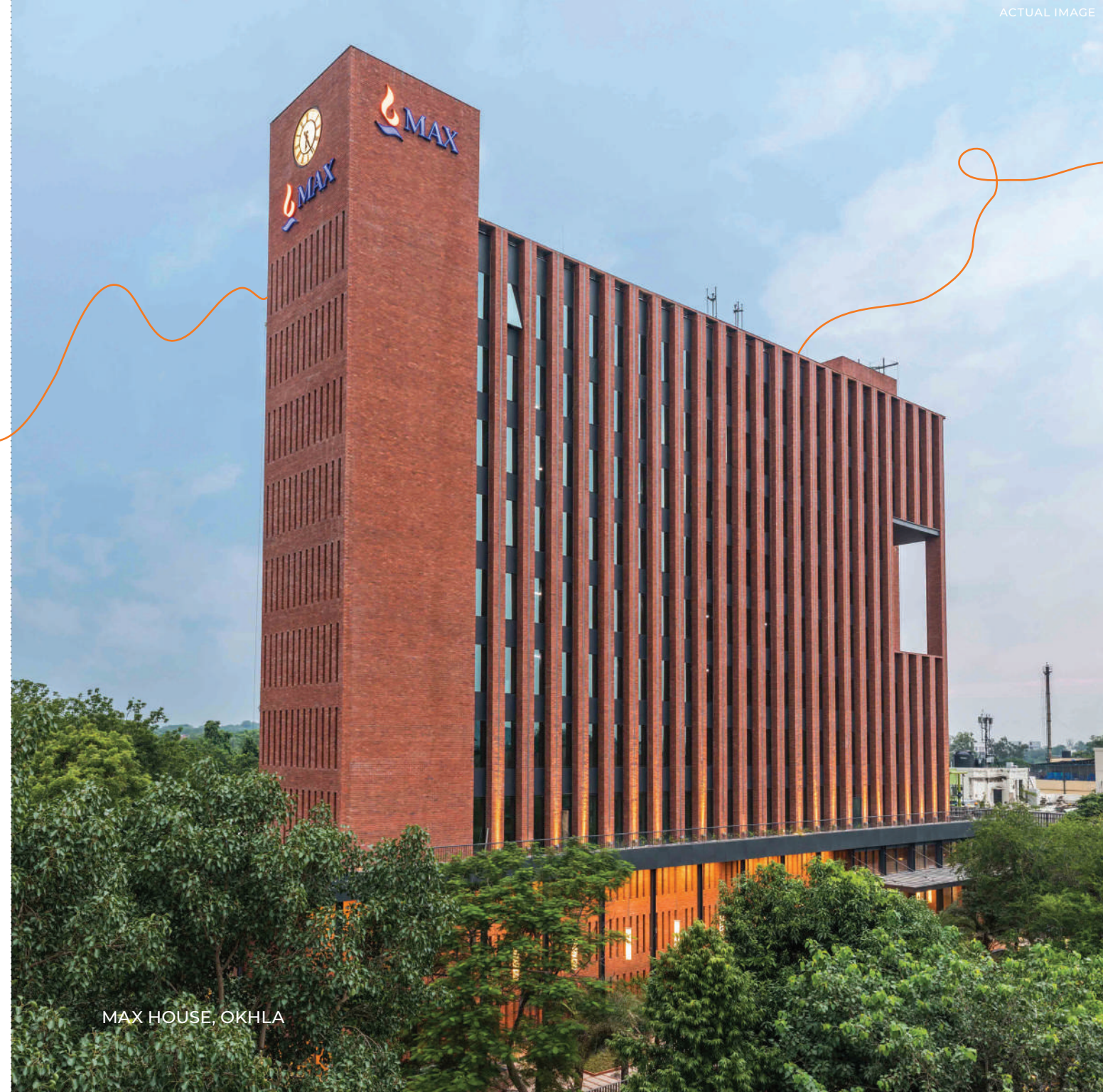
MAX HOUSE, OKHLA

Max House offers its tenants a host of F&B amenities, meeting and community building spaces at a well-connected, and easily accessible location in the heart of South Delhi. Max House Phase 2 is set to expand this space to an integrated campus, with an amenities block and two office buildings.