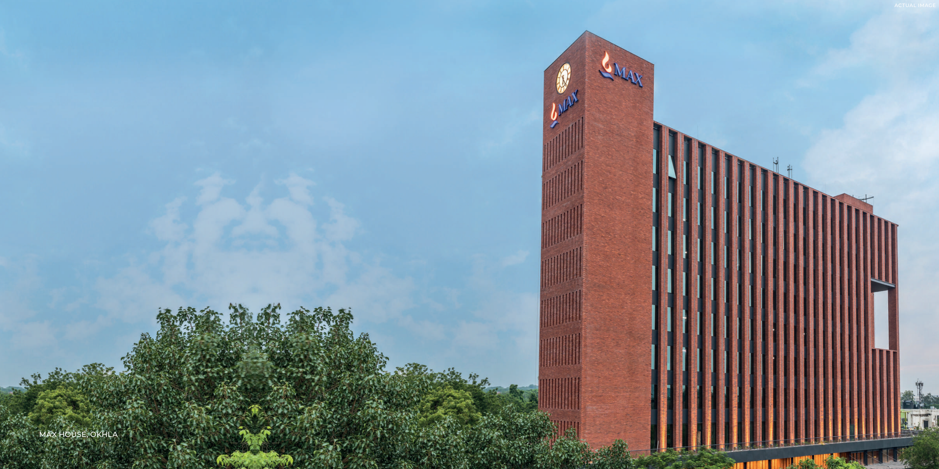
MAX HOUSE, OKHLA