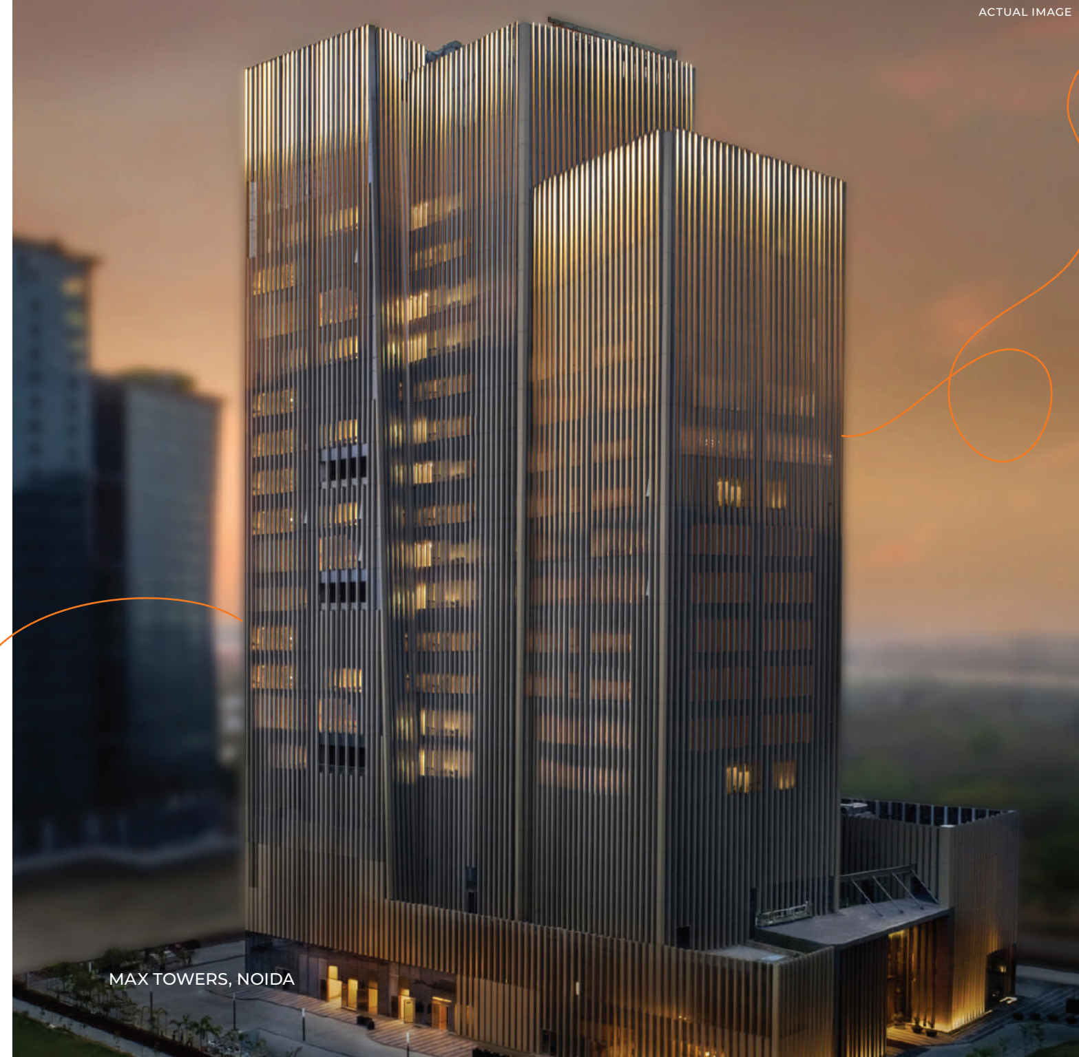
MAX TOWERS, NOIDA

Strategically located at the edge of South Delhi in Noida, Max Towers is a next-generation office building, LEED Platinum certified for Green Building Strategies, and IGBC Platinum rated for Health and Well-Being aspects. The building enables its occupiers to truly WorkWell through its in-house auditorium, host of operational F&B amenities, engaging art, an early learning center, meditation room, a 374 - seater cafeteria, and sports facilities. Max Towers is fully occupied by leading domestic and global organizations and is considered as one of the most premium workspaces in Noida.