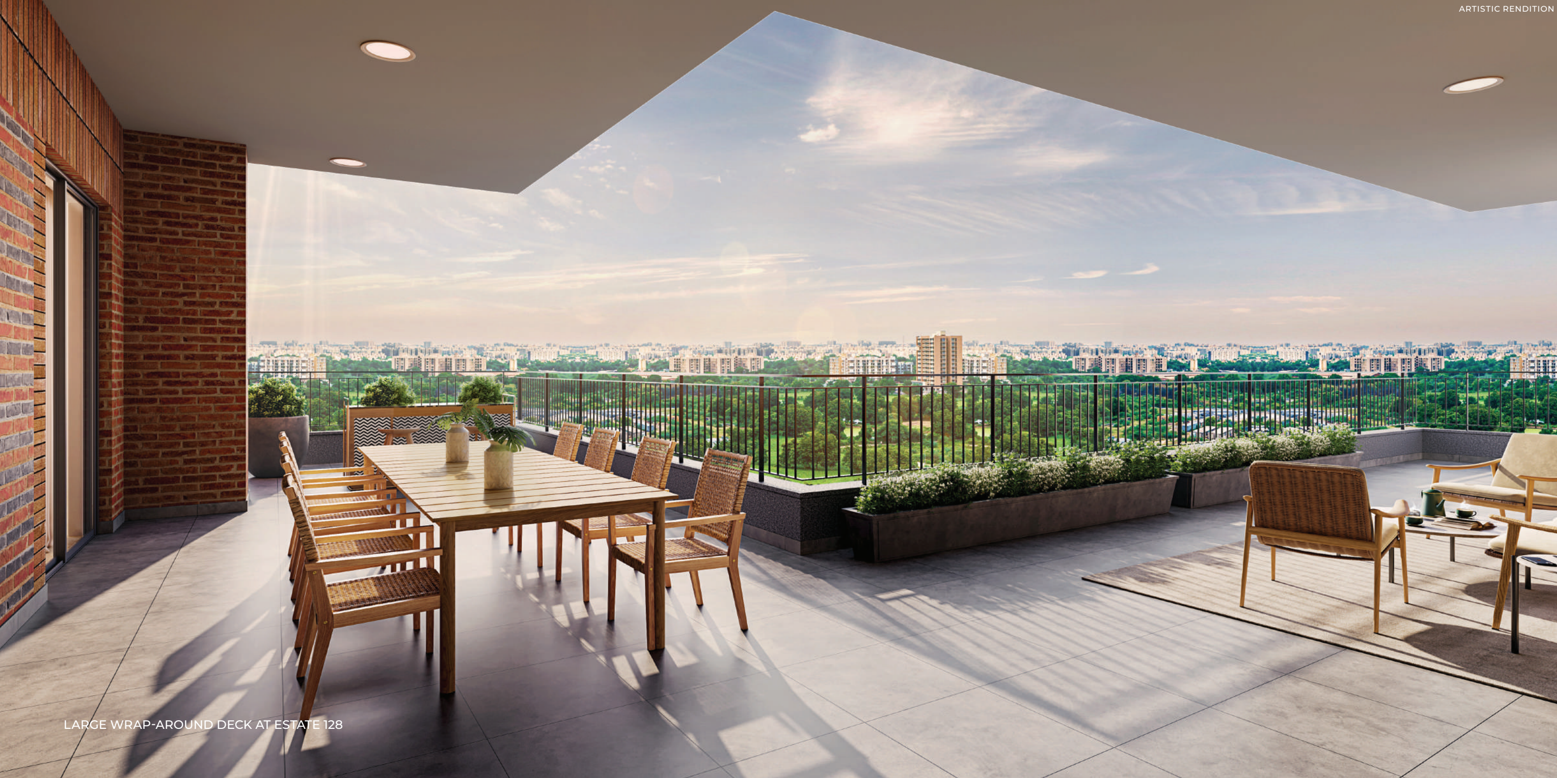
LARGE WRAP-AROUND DECK AT ESTATE 128