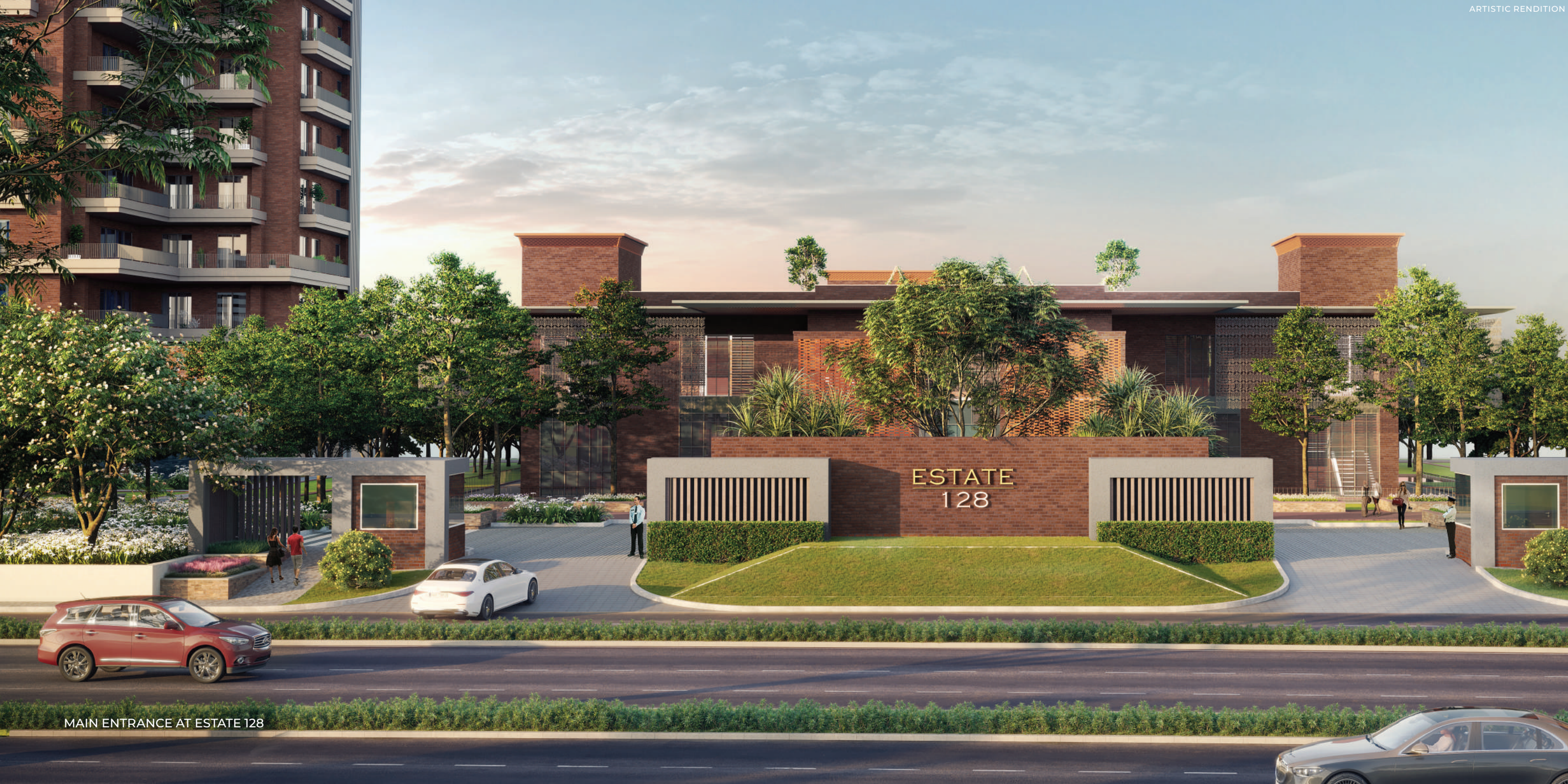
MAIN ENTRANCE AT ESTATE 128