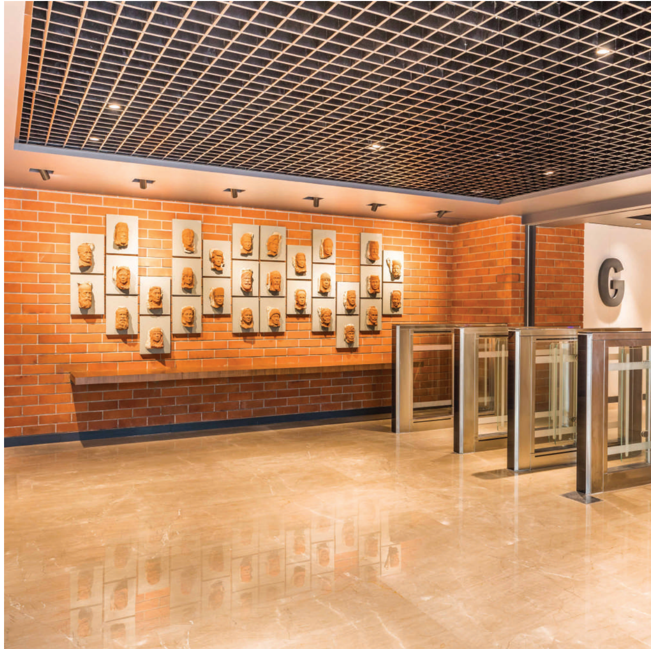
SECURITY TURNSTILES AT MAX HOUSE