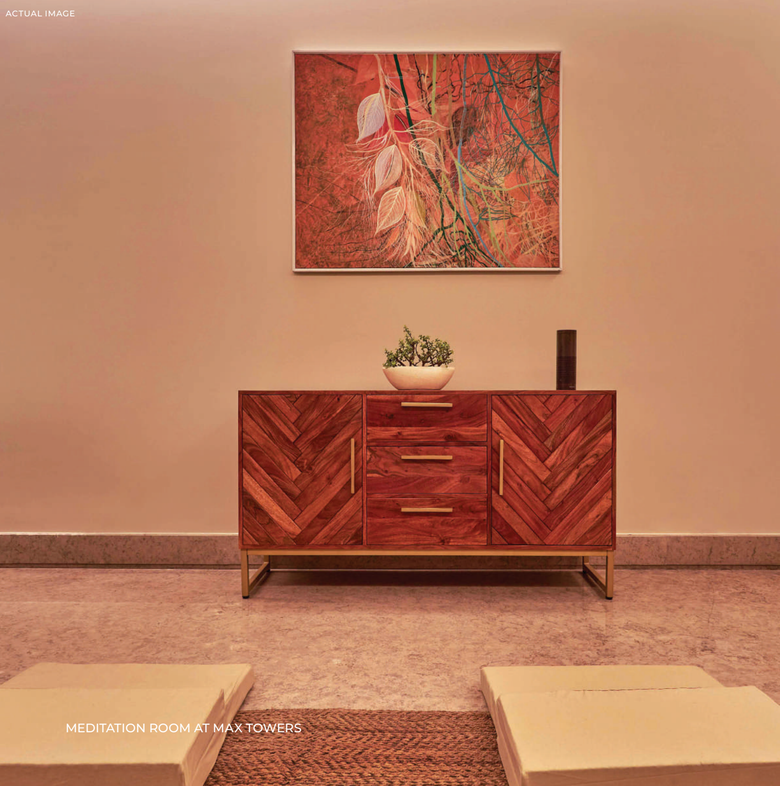
MEDITATION ROOM AT MAX TOWERS