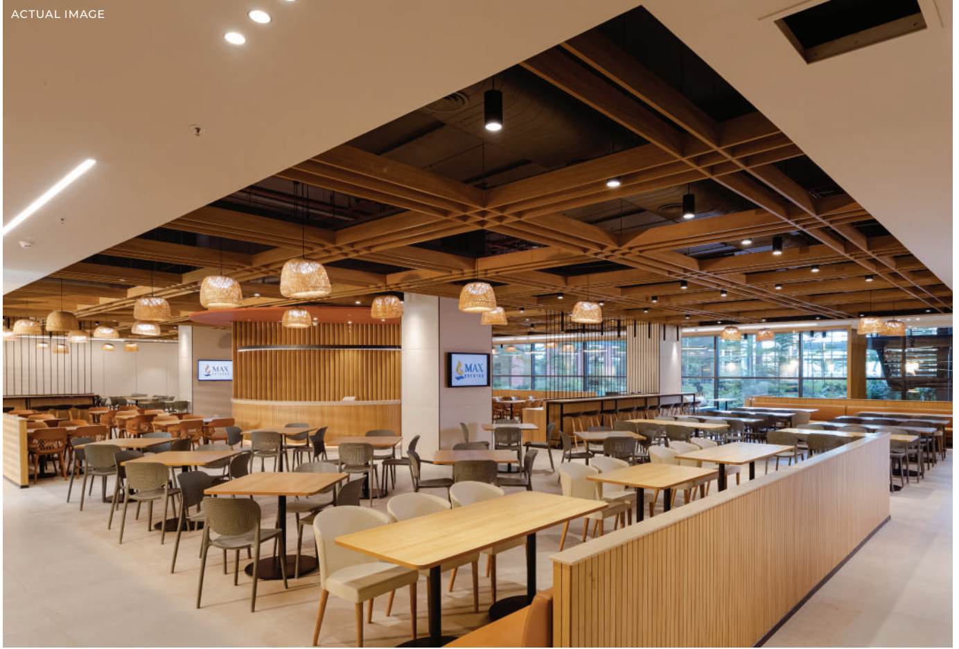
FOOD COURT AT MAX SQUARE